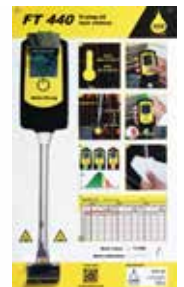
Oil Tester Storage Bracket