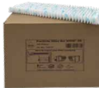
Box of 100 filters